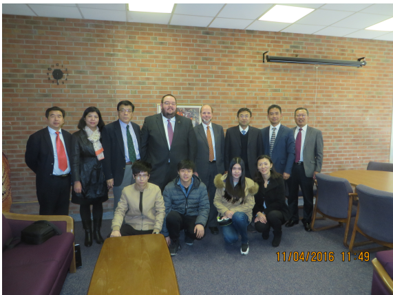
ZZULI Delegation visits Buffalo State