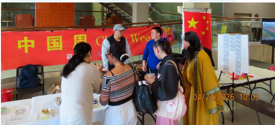
At the China Week site

community. Visitors from different cultural backgrounds exchanged ideas about Chinese festivals, clothing, food, art, written language, traditional customs, and martial arts. Some students showed strong interest in calligraphy, Chinese knots, the Chinese zodiac, and martial arts, while others learned more about Chinese history and social life through books on Chinese culture. These on-site interactions made China Week not only a cultural exhibition, but also a process of cross-cultural dialogue.