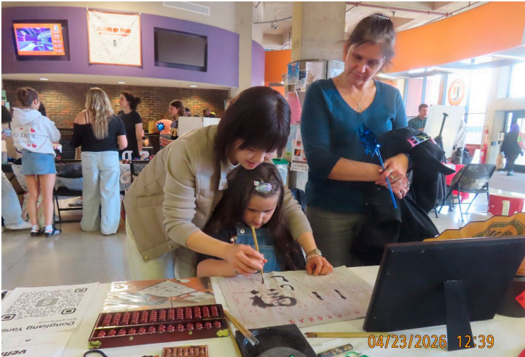
Learn Chinese calligraphy

The continued success of China Week reflects the important role of the Center for China Studies in advancing campus internationalization and deepening cultural understanding between China and the United States. Through the joint participation of visiting scholars, students, and community members, China Week 2026 connected traditional cultural displays, embodied cultural experiences, and contemporary campus engagement, bringing Chinese culture into an American university setting in a direct, approachable, and engaging way. Looking ahead, the Center will continue to use China Week and similar programs as platforms for cultural exchange, academic collaboration, and community outreach, to build bridges of understanding and respect among cultures. (Li Jinguo)