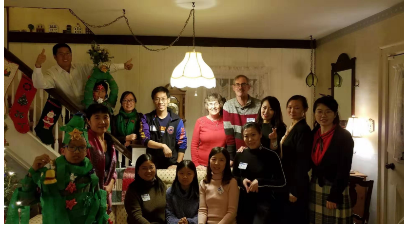
Visiting scholars celebrating holidays at the Klumpps in 2019.