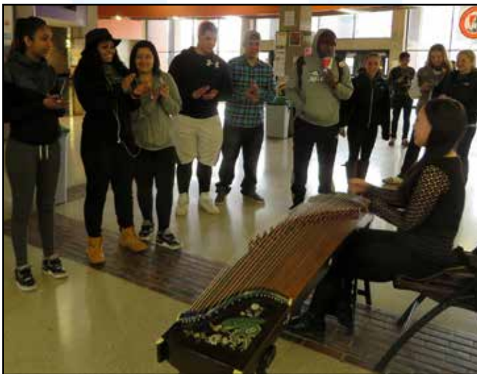
China Week at Buffalo State.

The ninth China Week, an annual event at Buffalo State since 2006, organized by the Center for China Studies, was held March 31–April 5, 2014. The main purpose of China Week is to promote a better understanding of Chinese culture and society in the U.S. Throughout the week, Chinese visiting scholars exhibited and sold some characteristic Chinese crafts, providing an interesting introduction to Chinese culture. The various exhibits attracted a large number of students, faculty, and staff who were interested in Chinese culture. They also enjoyed the opportunity