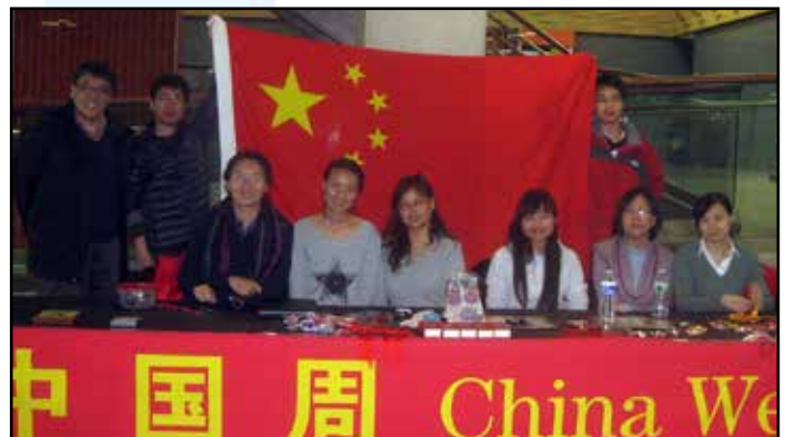
2013 China Week.

The 2013 China Week, an annual event at Buffalo State organized by the Center for China Studies, was held on the campus during April 8–12 with the main purpose of promoting a better understanding of Chinese culture and society. Throughout the week, Chinese visiting scholars exhibited some typical Chinese arts and crafts, providing an interesting introduction to Chinese culture. The various exhibits attracted a large number