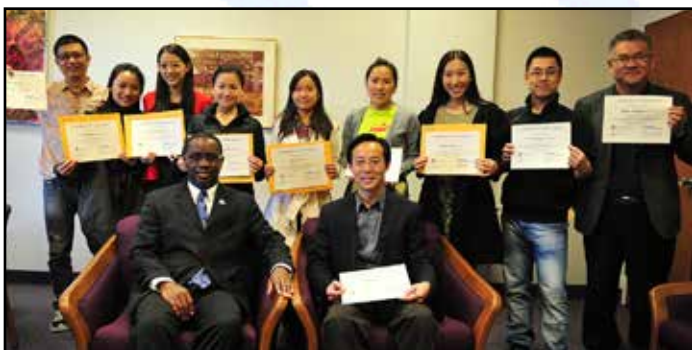
Tsinghua MPH Group Finishing the Program.

A delegation of twelve students from Tsinghua University of China spent one week at Buffalo State for training in the area of public health. They were members of Tsinghua University Center for Public Health studying for the Master's Degree (MPH). While on campus from April 20 to 27, they took classes in the morning and visited medical care facilities in the Buffalo area in the afternoon. They visited Buffalo General