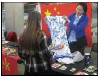
Showing Chinese Culture at the China Week Table.

of students, faculty, and staff who enjoyed the opportunity to chat informally with the Chinese presenters. In addition, two lectures on Chinese popular culture and Chinese traditional medicine were presented by Dr.