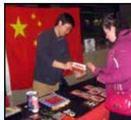
Introducing China to Buffalo State Students.

The 2013 China Week, an annual event at Buffalo State organized by the Center for China Studies, was held on the campus during April 8–12 with the main purpose of promoting a better understanding of Chinese culture and society. Throughout the week, Chinese visiting scholars exhibited some typical Chinese arts and crafts, providing an interesting introduction to Chinese culture. The various exhibits attracted a large number