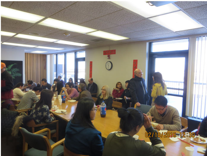
3+2 Students at the Chinese New Year Celebration

As part of the Chinese New Year celebration, a luncheon was held for the current 3+2 students on campus February 18 in the 4th floor conference room of the Classroom Building.