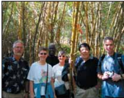
The Delegation in Hainan.

Mr. Zhu Yong took the Buffalo State delegation to several Chinese social welfare agencies in Beijing, Hainan Island, and Shanghai. The agency visits helped give the delegation a vivid picture of the comprehensive services that the Ministry of Civil Affairs provides to the Chinese people. The agency visits included an inpatient psychiatric hospital, community health clinic, community services agency, neighborhood community center, nursing home, day care center, and a foreign language institute. Members of the Buffalo State delegation were