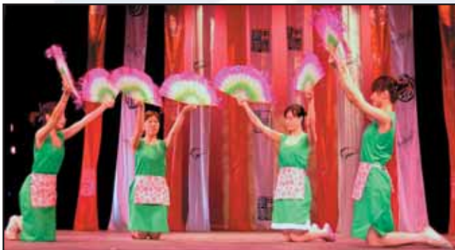
Asian Students Association presenting the Fan Dance.