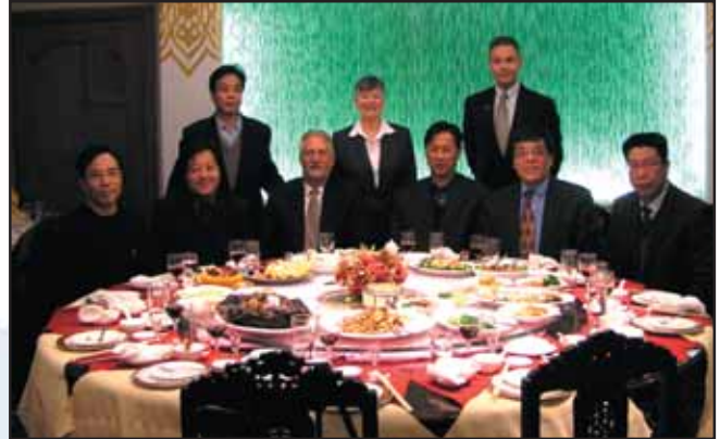
Buffalo State delegation and members of the Ministry of Civil Affairs.

impressed with the comprehensiveness of the agencies and with the services the agencies deliver to the Chinese communities.