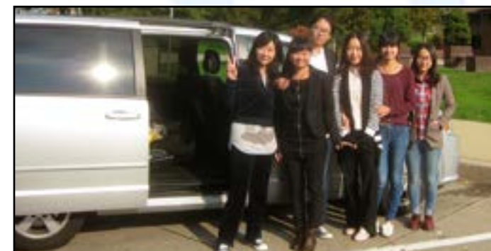
On Their Way to the ACPSS Conference in Pittsburgh.

The 18th ACPSS (Association of Chinese Professors of Social Sciences) International Conference was successfully held at the University of Pittsburgh from October 5–7, 2012, thanks in great deal to co-sponsorship and generous support of the East Asian Library and the Asian Studies Center of the University of Pittsburgh. The United Societies of China Studies (USCS) also