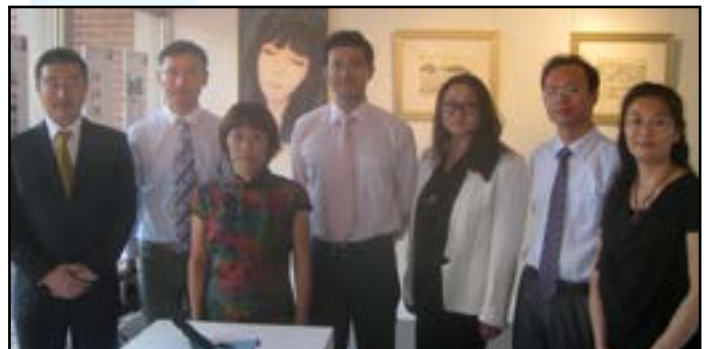
Beijing City University Delegation.

A delegation of seven faculty members from Beijing City University (BCU) visited Buffalo State at the beginning of the fall semester. The delegation was composed of visual artists from the University's School of Fine Arts. An exhibit of the art works by the BCU fine arts faculty was displayed in the Upton Gallery, which attracted a large number of students, faculty, and staff