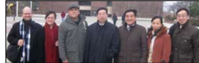
Chinese Education Delegation on Campus.