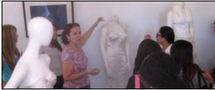
Lecture on site.