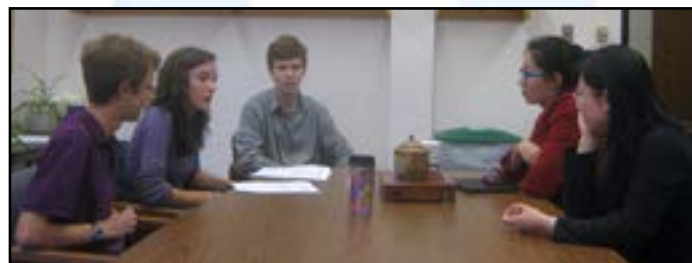
East Aurora High students visited the Center.

The Center for China Studies hosted three high school students on October 18 from East Aurora High School, who visited the Center as part of a field studies project on China-related issues. The mission of East Aurora High School is to provide learning experiences that help each child to achieve his or her maximum intellectual, social, physical, emotional, and moral growth and development.