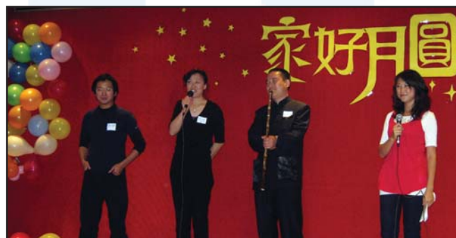
CSSA Celebrating the Moon Festival.