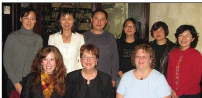
BTTTCE Scholars with Staff Members.

cation (BTTTCE), the Center for China Studies assists with a program on campus to host visiting scholars from Beijing each academic year. The scholars are selected by BTTTCE from the thirty-six universities and colleges under the administration of the Education Commission of Beijing. At Buffalo State they are paired with faculty members who serve as mentors during their visit to the U.S. After very successfully hosting three visiting scholars in spring 2009, Buffalo State now has six new scholars from BTTTCE, who are planning to stay for six months.