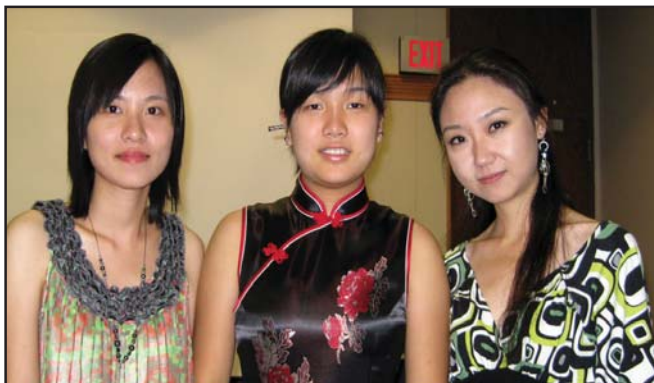
New Students from China.

The number of Chinese students is on the rise as a consequence the CCS's efforts to recruit undergraduate and graduate students in China. For Fall 2008, there have been four undergraduate and two graduate students directly recruited from China by the CCS. More students are expected from China in the next few years.