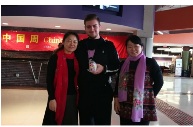
Visiting Scholars with a Student at China Week 2019