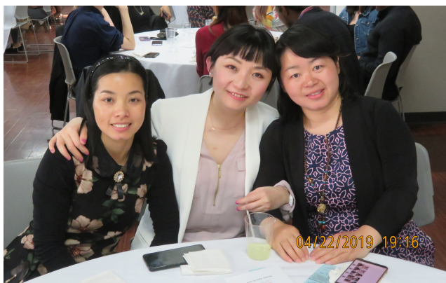
Visiting Scholars at the Sociology Awards Banquet