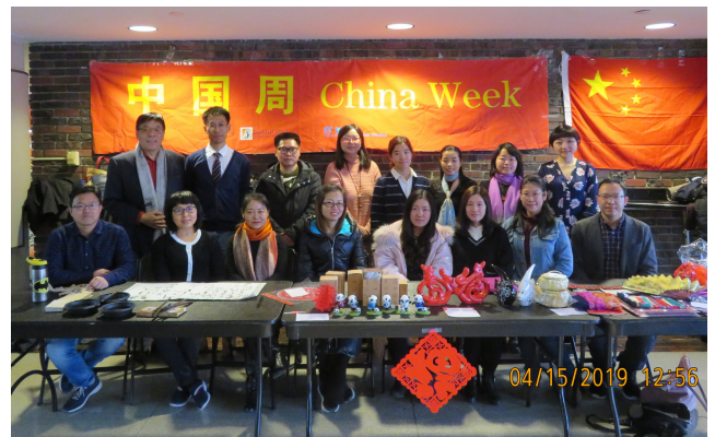
Visiting Scholars at China Week 2019

Though the exhibit represented only a drop from the vast ocean of Chinese culture, it proved highly popular among the Buffalo State students, faculty, and staff, that passed by and triggered their interest in Chinese culture. The five-day-long China Week provided a delightful opportunity for most of the visiting scholars and students from China at Buffalo State to work together as cultural guides and introduce the college community to some of the beauty and mysteries of ancient Chinese culture. China Week strengthened cultural communication and represented a new stage of cultural exchange between Buffalo State and universities in China. (Li Yingjie)