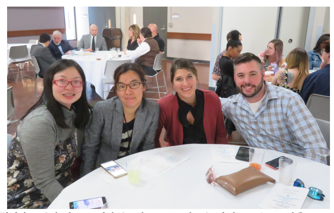
Visiting Scholars with Students at the Sociology Award Banquet