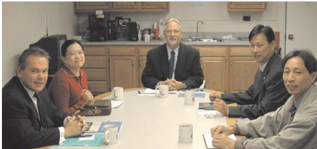
Meeting at the Research Foundation

A truly memorable moment of the visit was the delegation's negotiating with the cook (in Chinese) for a more authentic meal in a Chinese restaurant in the tiny Village of Perry, near Letchworth, where not a single pair of chopsticks was to be had!