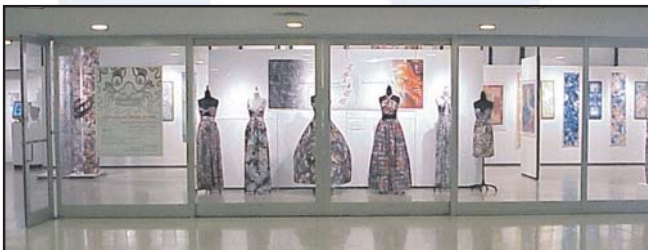
Upton Hall Gallery

From September 16 to October 4, Upton Hall Gallery hosted a digital textile design exhibition entitled Inspirational Chinese Designs: East and West Interpretations . This collaborative exhibit featured work by faculty at Buffalo State College and Capital Normal University in Beijing.