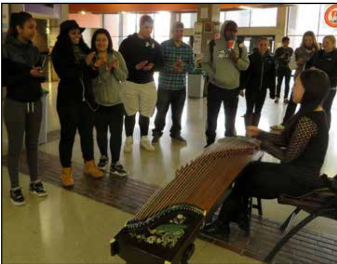
China Week at Buffalo State.

The ninth China Week, an annual event at Buffalo State since 2006, organized by the Center for China Studies, was held March 31–April 5, 2014. The main purpose of China Week is to promote a better understanding of Chinese culture and society in the U.S. Throughout the week, Chinese visiting scholars exhibited and sold some characteristic Chinese crafts, providing an interesting introduction to Chinese culture. The various exhibits attracted a large number of students, faculty, and staff who were interested in Chinese culture. They also enjoyed the opportunity