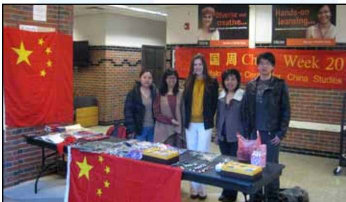
Visiting Scholars Exhibit Chinese Crafts.