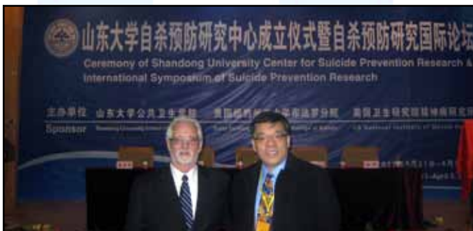
At the Opening Ceremony of the Center of Suicide Prevention Research.