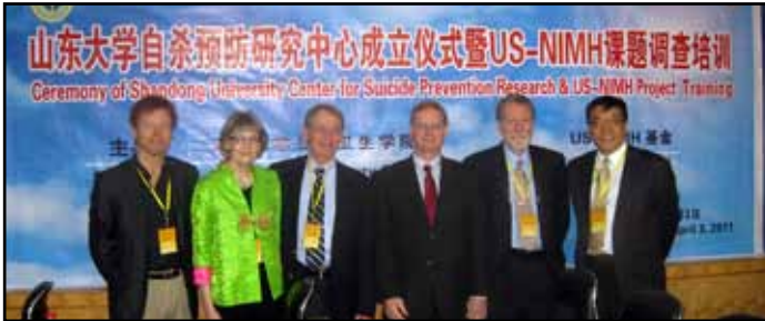
The Buffalo State Training Team at Shandong University.