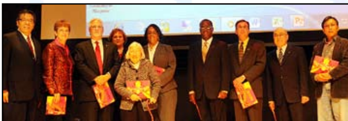
CCS 10th anniversary.

The Center for China Studies celebrated its tenth anniversary on October 6 at the Burchfield-Penney Art Center. The daylong program attracted over 500 students, faculty, administrators, staff, and members of the local community interested in China and China studies. The