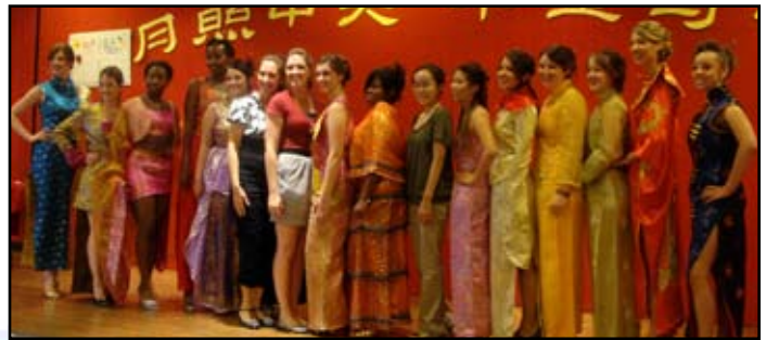
Models in the fashion show.

Taiwan, said that Buffalo State's celebration of the Moon Festival was "amazing." After dinner all participants received a Chinese moon cake as a token of holiday wishes from Buffalo State's CSSA. (Text by Zhao Sib0)