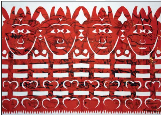
Chinese Papercut by Song Hongyu.