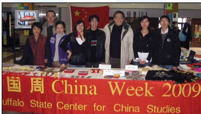
At the China Week Exhibit in the Student Union.

March 9–13 marked the third China Week at Buffalo State College. The Chinese Arts and Crafts Show in Campbell Student Union that week attracted large crowds of Buffalo State students, faculty and staff members, as well as the general public. Visiting scholars and Ph.D. students from China played a major role in organizing the exhibition.