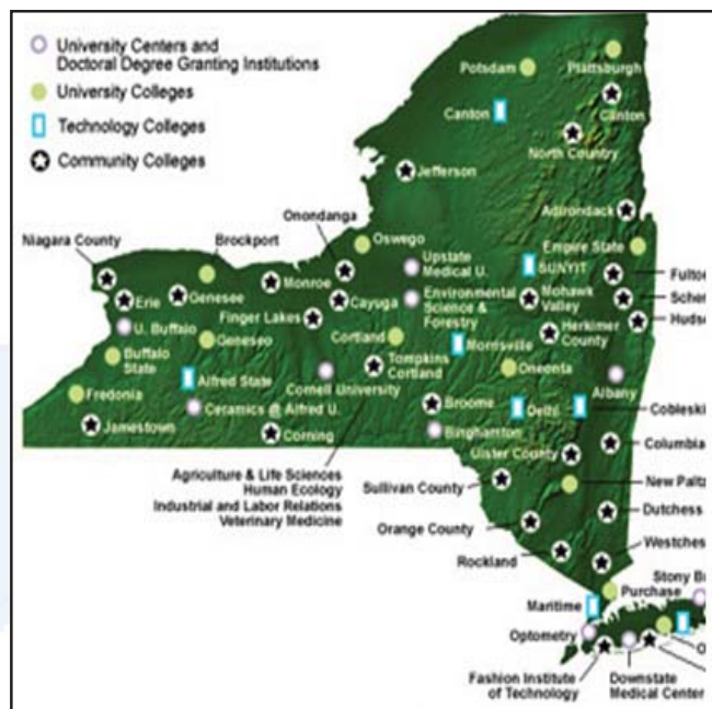
Figure 1 The SUNY Campuses in New York State