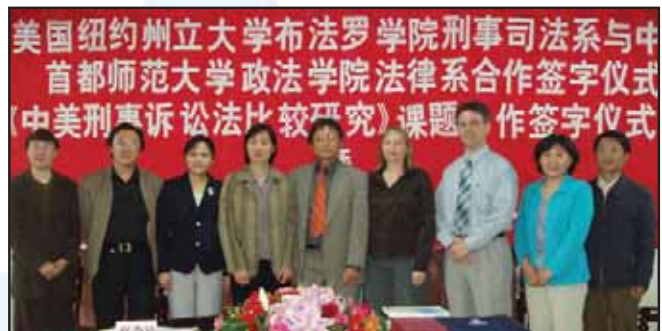
Criminal Justice Department with Capital Normal University.