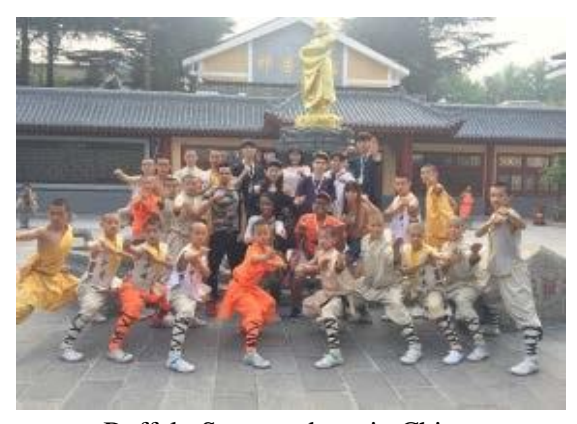
Buffalo State students in China