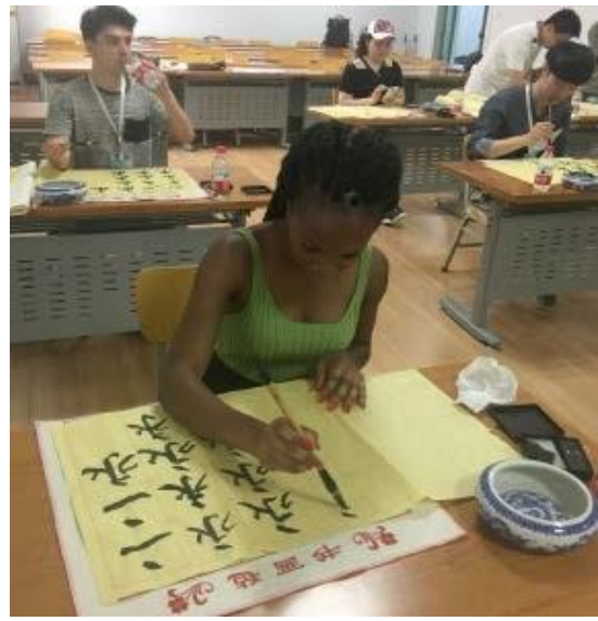
Buffalo State students learning the Chinese calligraphy at ZZULI summer camp

I simply loved China. I loved the arts, calligraphy, and above all the paper cutting used to decorate during holidays! One day I hope to go back to China to reunite with my friends for eternity. I also hope more than ever that others will be open minded enough to embark on such an opportunity. I always say that traveling to another part of the world helps one find their true self and true ability. The world is our home.